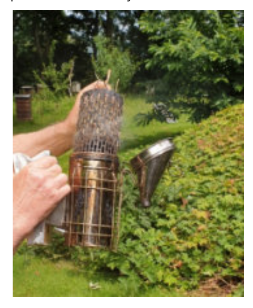
10. When it goes out ... and smokers always go out, simply lift out the basket and re-light from the base – 20 secs.

I noticed about that same time I first made one of these that Thorne sold such an item but being a meanie, I have continued to make my own. It seems now that Thorne or anyone else for that matter has stopped selling these ...unless you know differently? ... in which case probably easier to push the boat out ... buy one and stop all this messing about ... unless you a meanie like me.