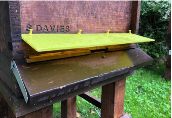
Not as elegant as a WBC but it does the job, especially in prolonged heavy rain (thanks to Peter Cammack).

Any Correx left over can become a porch roof. Cut a piece 100 mm deep and the width of the brood box. Then pin in place as shown below: