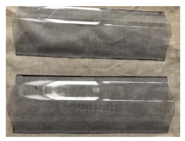
To use, simply pin the top edge to the hive covering the entrance then block one end completely.