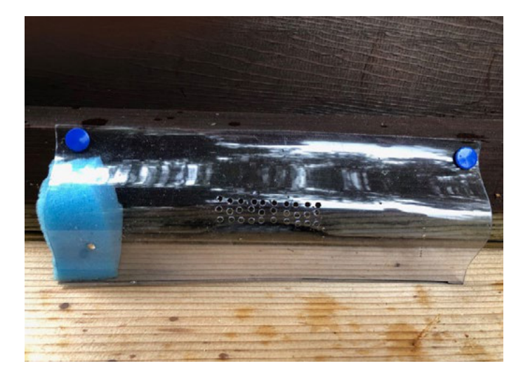
Next, reduce the other opening to one bees width. I have used pieces of foam entrance block but any suitable material will do.