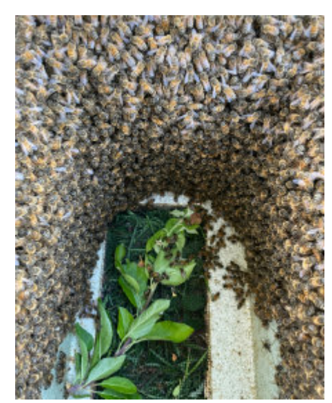
The kitchen garden nuc.

13th of May I was called to collect a swarm from a kitchen garden. All seemed normal, so went ahead as before. On this occasion though the swarm had already been collected into a nuc when I arrived but again it wasn't a Langstroth and there were no frames in it.