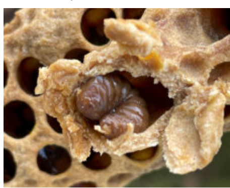
Black Queen Cell Virus.

15th of July suspicious that I still had no hatching in the 'Cut and Shut', I opened up a queen cell and found a black larvae. There was my answer – I had Black Queen Cell Virus. Both cells