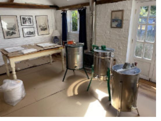
The extraction room at Dominic Charles's farmhouse.

time, if you want to go full fancypants get yourself a motorised to save on the hand cranking. If hand cranking, start slow and gentle, if you are too aggressive too early the force will blow out your frames and you won't be able to reuse them. After a gentle spin (on both sides if using tangential) then you can increase the pace to extract the honey. If you find that your spinning seems to be slowing or you can feel pressure it's probably because you