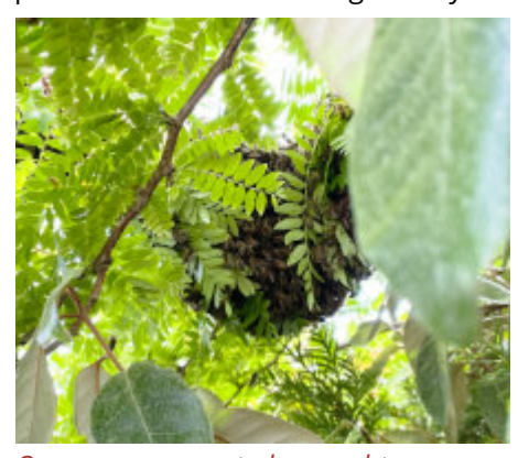
One more swarm to be caught.

14th July brought another challenge. I responded to a post on the swarm group to collect a swarm in Mayfield. My first entirely solo collection of a swarm. They were on a branch at the top of a garden hedge. Having assessed the situation, made the ladder stable and suited up I held a nuc under the branch and gave the branch a thump to knock the clump of bees off and into the box. I then placed it on the floor and gave any