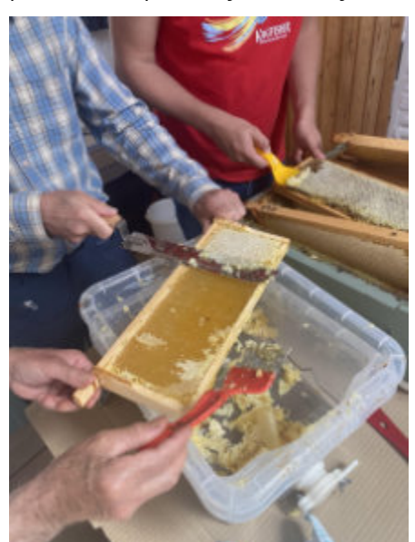
Essential tools – uncapping knife and fork.

time, if you want to go full fancypants get yourself a motorised to save on the hand cranking. If hand cranking, start slow and gentle, if you are too aggressive too early the force will blow out your frames and you won't be able to reuse them. After a gentle spin (on both sides if using tangential) then you can increase the pace to extract the honey. If you find that your spinning seems to be slowing or you can feel pressure it's probably because you