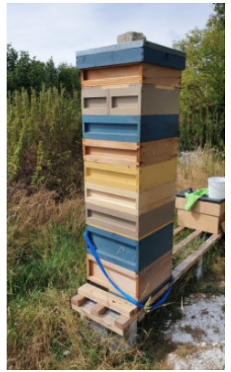
Up to seven supers where stacked on top of the brood box.

My two now terminally queenless hives had a problem. I was out of alternatives. It was too early to use eggs from my cast as she wasn't laying yet. In the end I used Google and found a supplier of good quality queens. Albeit it a fairly steep price of £50 each. I managed to introduce both to their hives successfully. Currently I have had enough honey from both of them to pay for