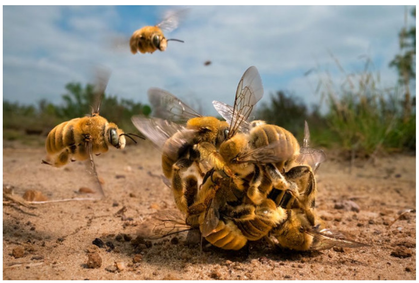
From BBC News: "Frenzied bee ball" wins top prize in the Wildlife Photographer of the Year competition. It's a manic moment as male cactus bees envelop a single female. But who in this amorous scrum will emerge lucky and get to mate with her? This remarkable picture, captured by Karine Aigner, is the grand title winner in this year's Wildlife Photographer of the Year competition.

On one level it's quite a technical image. It required the use of a macro probe lens to get in close to the very heart of the action.