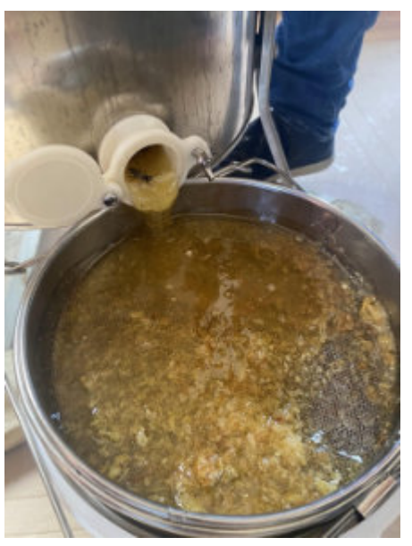
Honey running into the double sieve along with a poor drowned bee.

It sounds a little melodramatic to say clean up is imperative but unless you want to be inundated with bees and wasps it really is important to clean every last bit of honey from your extraction location and be very