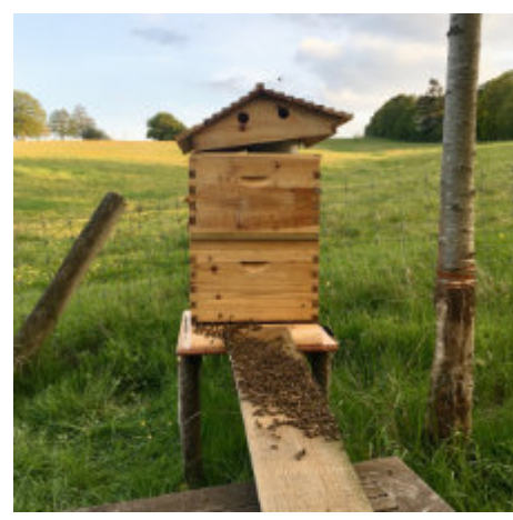
First swarm caught.

On the 27th of May 2021 I ended up acquiring a swarm that had landed in a neighbour's orchard and was making itself unwelcome (as my husband is a farmer, neighbours are