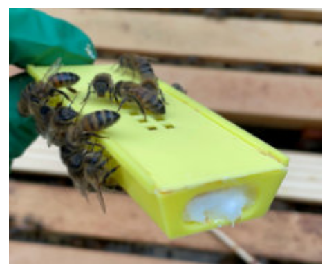
A new queen is introduced.

in the hive were affected as well as the back-up gueen cell in the larder. They were still queenless.