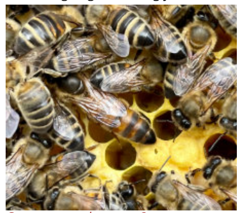
Can you spot the queen?

At least in the 'Mayfield swarm' there was better news. I located a beautiful queen, and they'd been busy, I found eggs and larvae. They had started storing pollen and nectar. It was all going swimmingly!